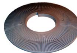
Ribbed Plate 423-GRY-S