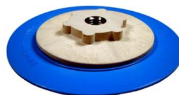
Plate 422-BLU attached to the hub.