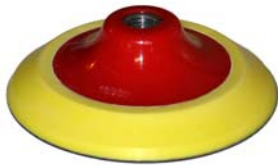
640 & 641 Style

Koltec cushioned pads for PSA adhesive back and glue on discs are designed for tools with straight rotation, not dual action. They have a sturdy back plate with female 5/8-11 threaded arbor.